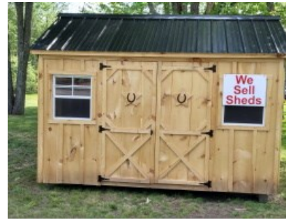
Board & Batten