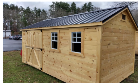
Tongue & Groove