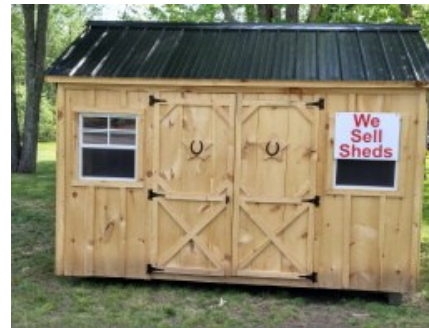
Board & Batten