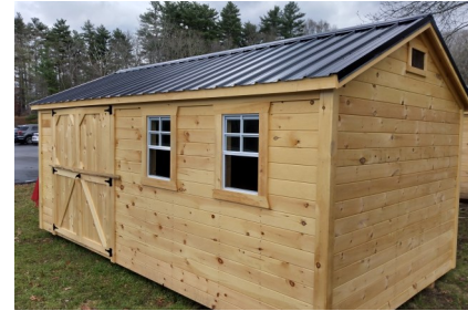
Tongue & Groove